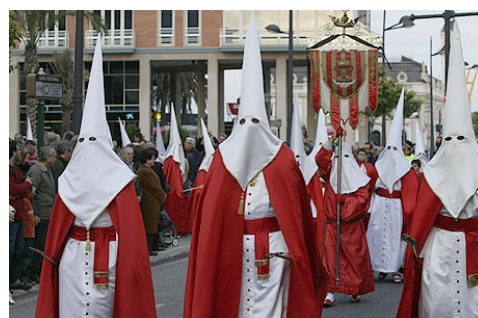
Holly Week in Valencia in the maritime neighborhood

The last Wednesday in August, the town of Buñol, in Valencia, goes bonkers with La Tomatina , a big huge fight inside the town, where the weapons are tons and tons of tomatoes.