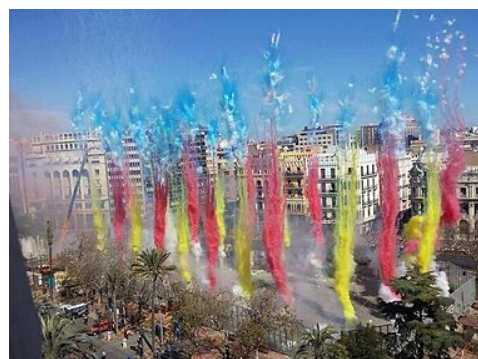
Fireworks in Las Fallas

Carnaval takes place throughout the country in late February; despite of the wildest is said to be in Sitges, the most known is set in Canarias and in Cádiz. In March, Valencia has a week-long party known as Las Fallas , pride of the city, which is marked by all-night dancing, drinking, first-class fireworks and colourful processions.